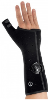
Exos Thumb Spica Fracture Brace